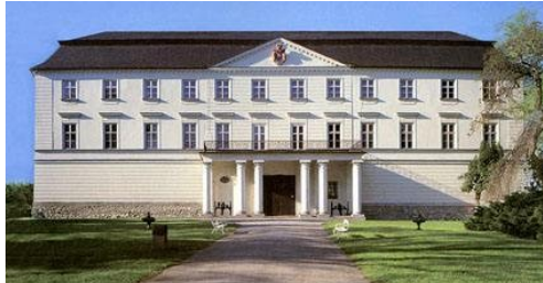
White Mansion – former duke residence