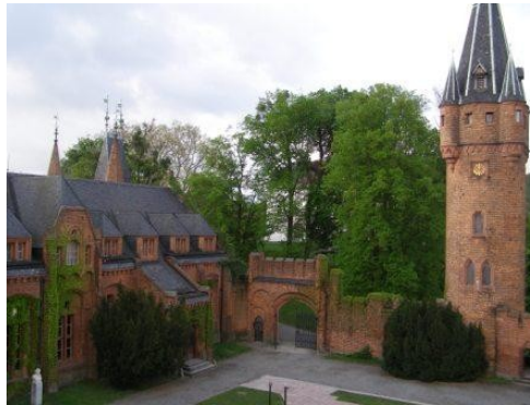
Red Mansion – the conference place

Faculty of Information Technology - Brno University of Technology