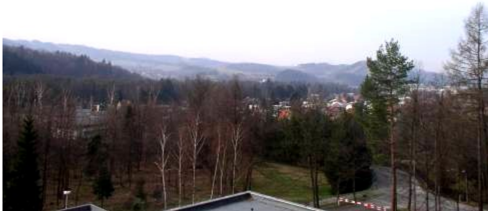
Environs of the Hotel