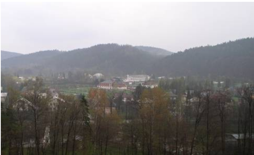
Environs of the Hotel